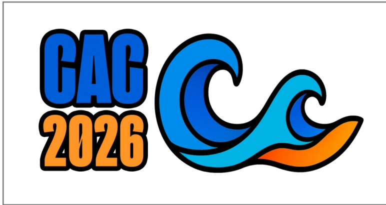
Color Logo For general use.