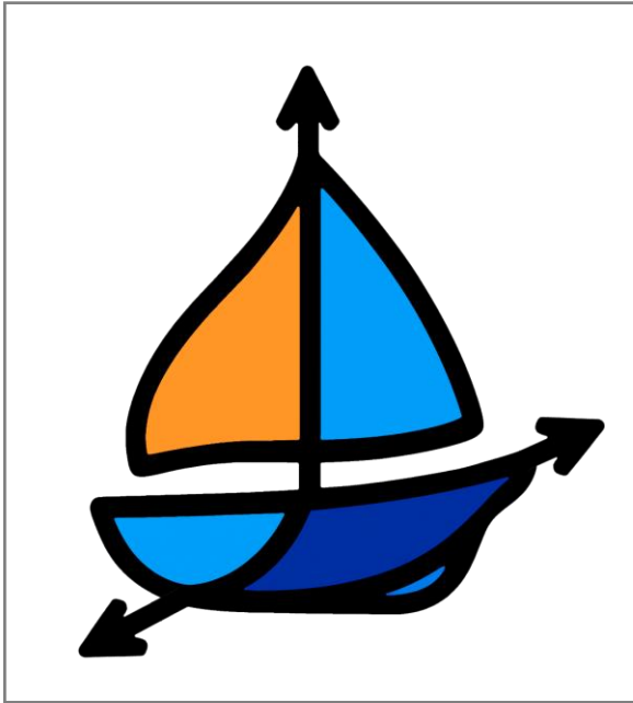
Color Decorative Element For general use