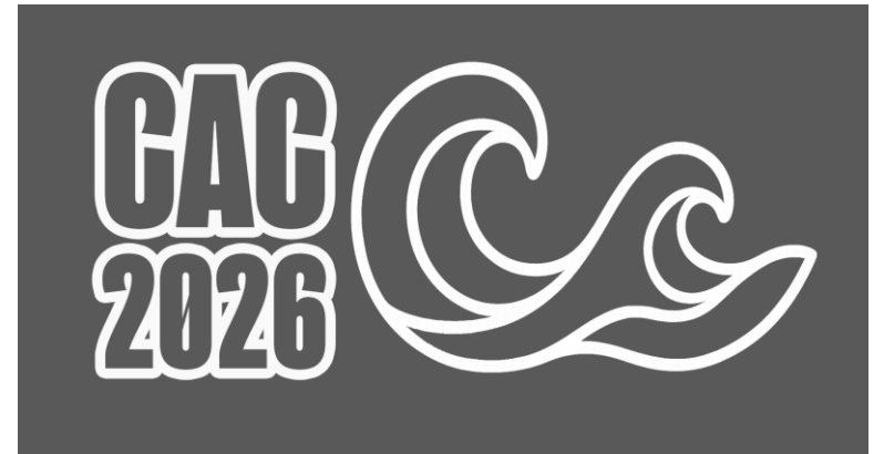
White Logo For use on dark backgrounds to ensure optimal visibility.