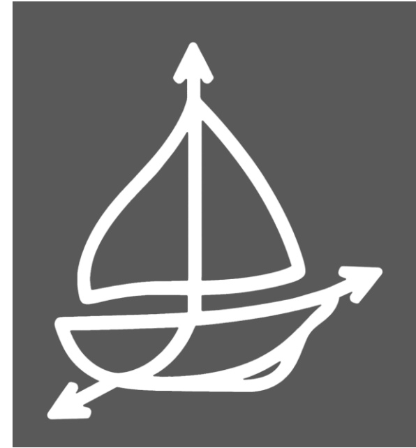
White Decorative Element For use on dark backgrounds to ensure optimal visibility