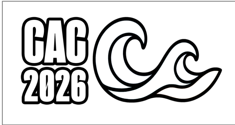
Black Logo For producing materials in black and white.